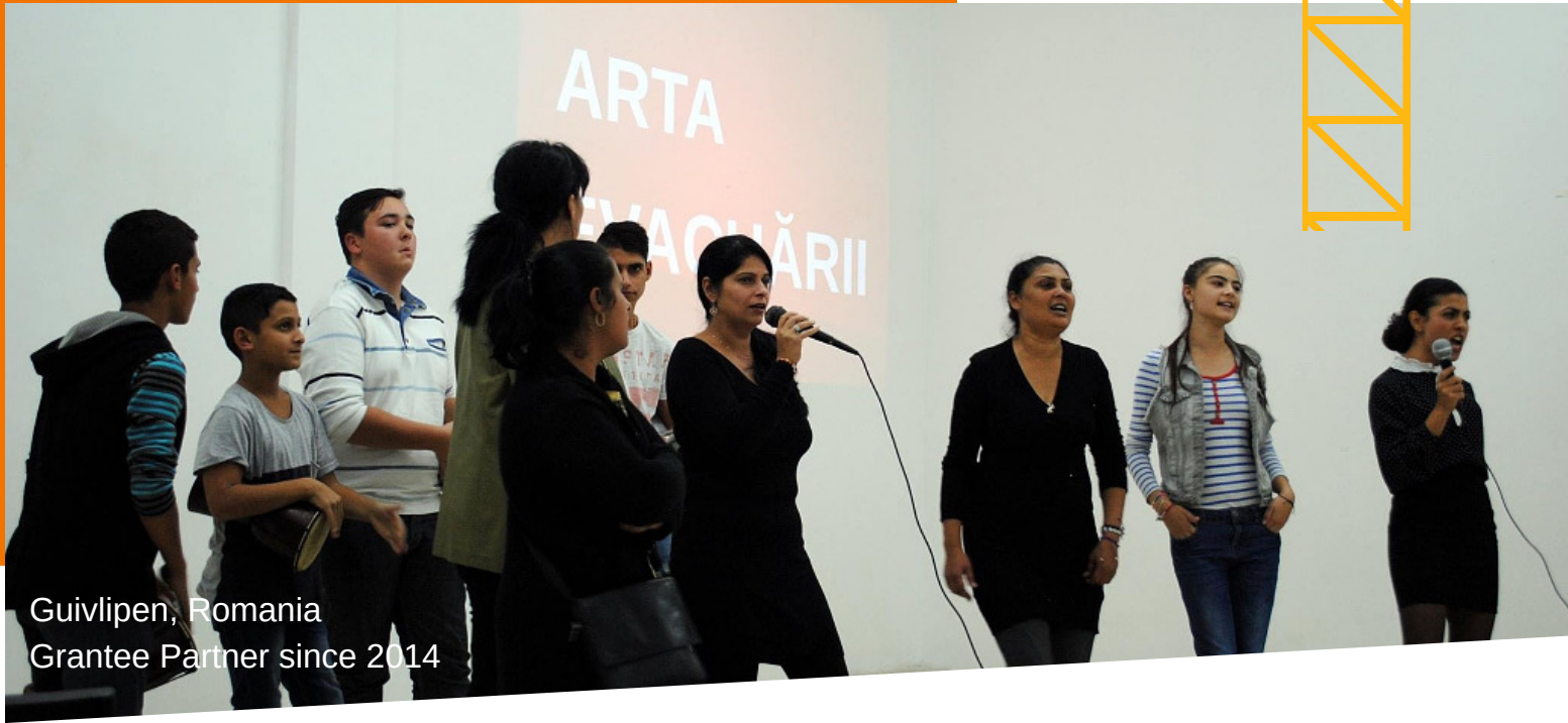
Guivlipen, Romania Grantee Partner since 2014

In the 2014/15 grant cycle, FRIDA provided direct and capacity developments grants to the following five groups in the Global South working on Forced Marriage as a primary and secondary focus area.