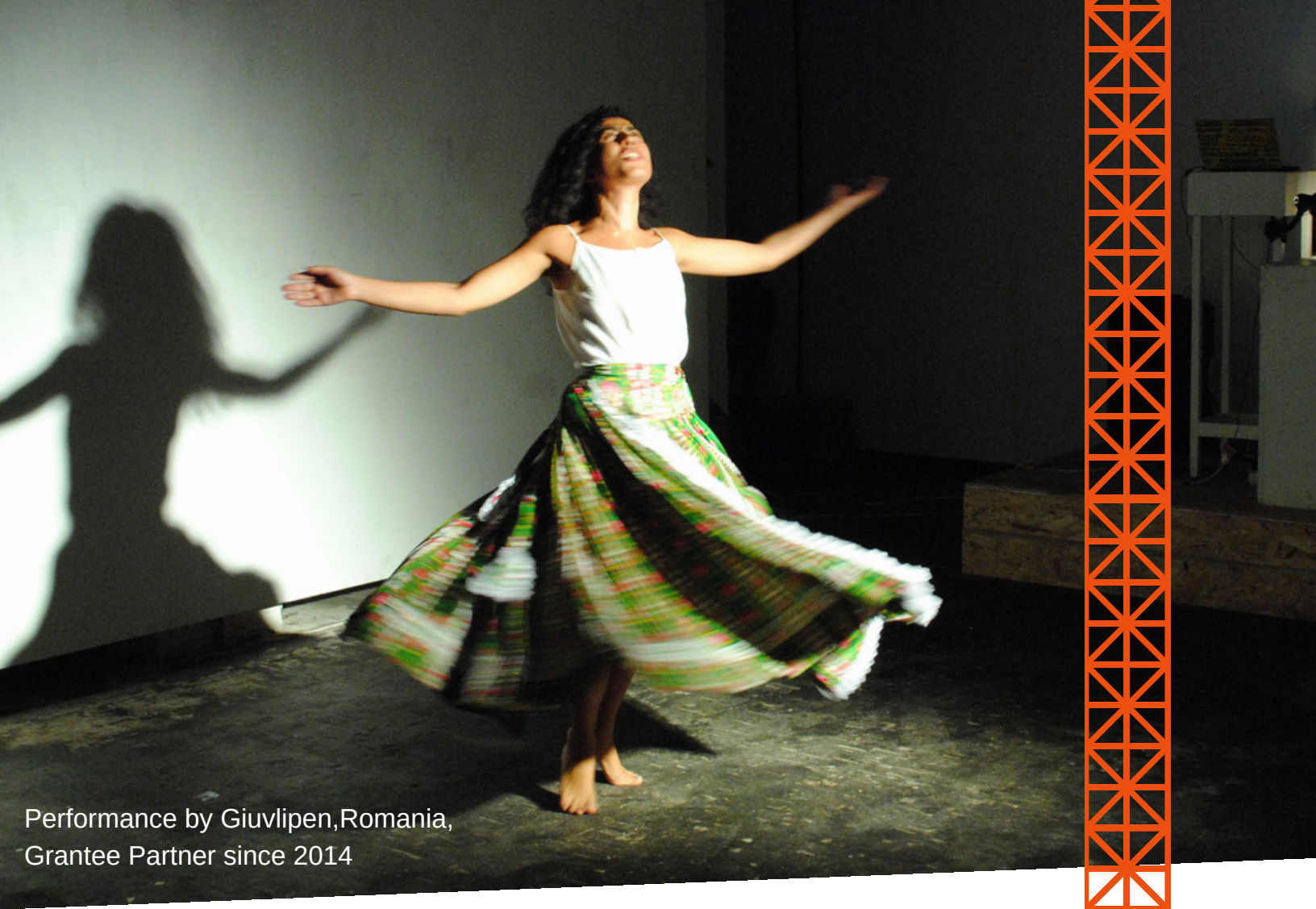
Performance by Giuvlipen, Romania, Grantee Partner since 2014